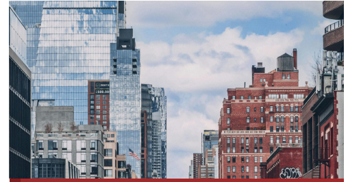
URBAN POWER GRIDS