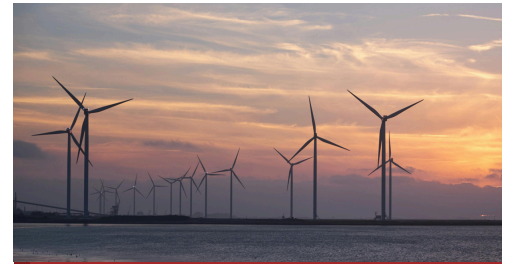
RENEWABLE ENERGY SITES