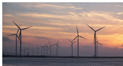
RENEWABLE ENERGY SITES